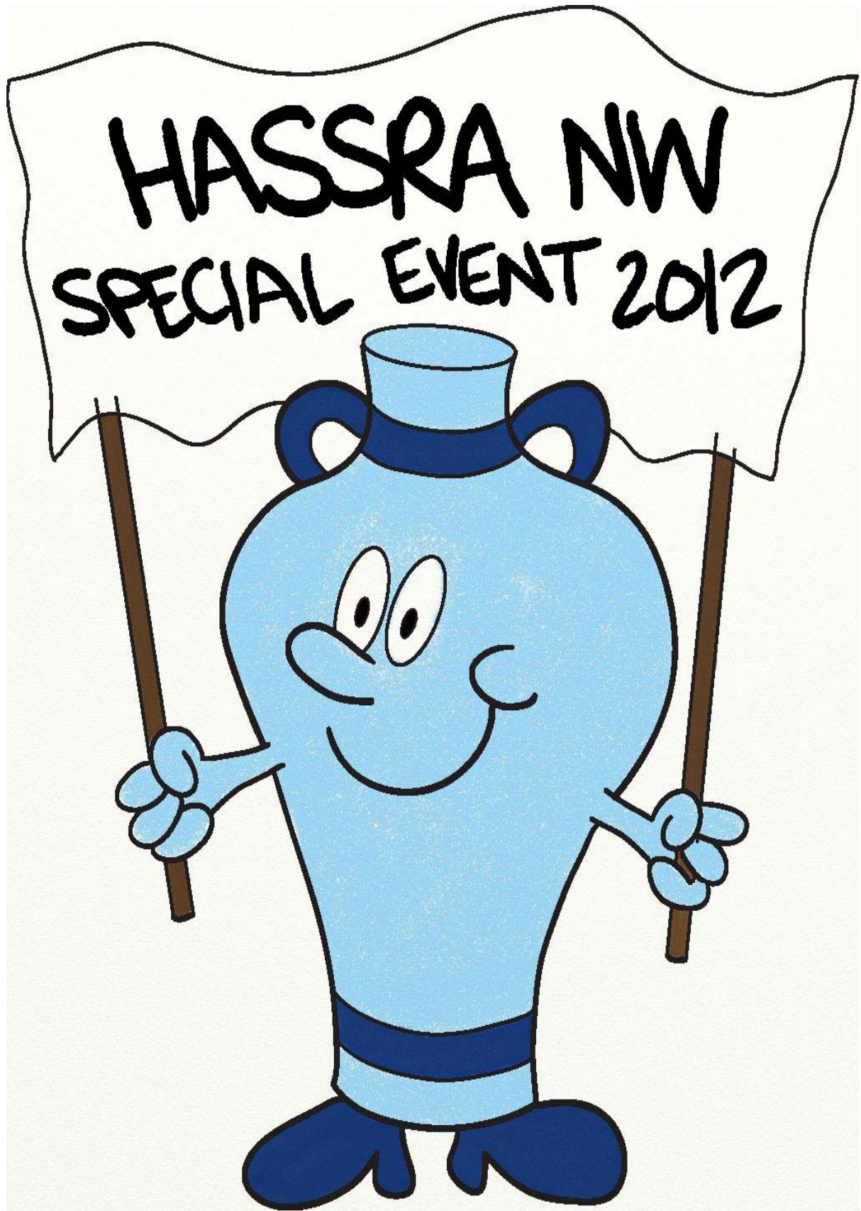
URNY – Official Mascot of Hassra NW Special Event 2012